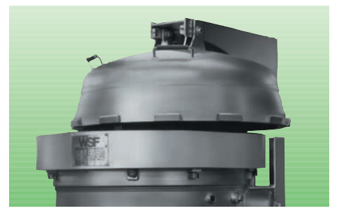
RAPIDOOR is available in a variety of design styles to meet space and application requirements.