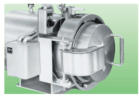
RAPIDOOR provides a secure, positive closure with rapid access.