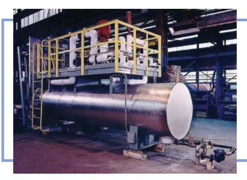
WSF provides complete in-house engineering, fabrication, and testing of its processing systems used for vulcanizing.

Rubber steam curing system features an autoclave for steam/hot water curing of rubber stoppers used in medical vials. Parts are cured at 350°F and 120 psig. Features a 240-gallon hot water storage tank and RAPIDOOR for top loading into a 33-in. I.D. by 36-in. deep chamber.