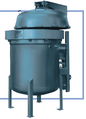
WSF's rubber vulcanizers can be equipped with controls designed specific to your needs.

Vertical vulcanizer with 43-in. I.D. and 44-in. deep tank for processing vee-belts and automobile hoses. Features a special davited door.