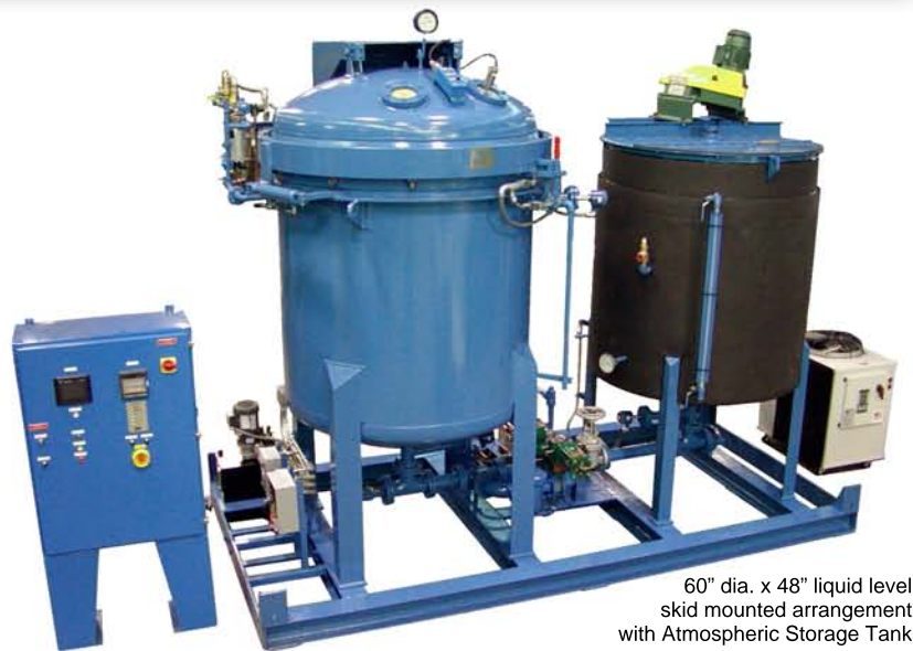
60" dia. x 48" liquid level skid mounted arrangement with Atmospheric Storage Tank

VACUUM PRESSURE IMPREGNATION FOR MANUFACTURING INDUSTRIES