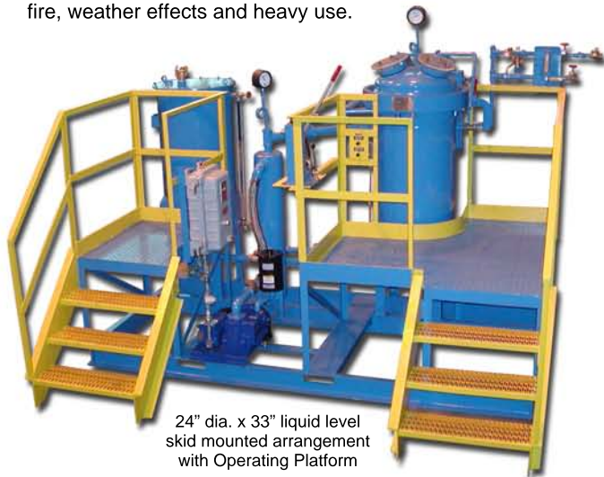
24" dia. x 33" liquid level skid mounted arrangement with Operating Platform

Impregnate wood products to protect against rot, insects, fire, weather effects and heavy use.