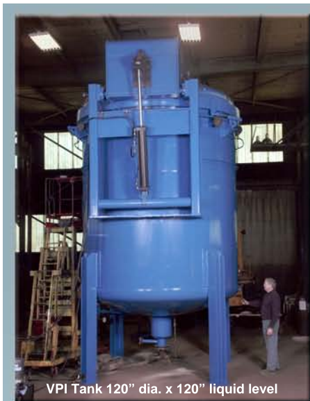
VPI Tank 120" dia. x 120" liquid level

VPI Cycle and Access Door controls are custom designed at WSF for each installation. Control systems range from fully automated PLC controls to semi-automated hard-wired systems. Automated systems include an HMI Operator Interface Terminal, process recorder with fan-fold chart. Options include continuous level sensing, part temperature measurement (integrated with cycle controls), capacitance monitoring, paperless data logging, remote monitoring via Ethernet communications.